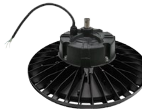
Socket set screw